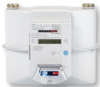
RF1 iV PSC with smart card

Two-way multi-resource prepayment system: Eclipse Enterprise Edition (3E)