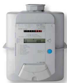
RF1 iV PSC Single Pipe