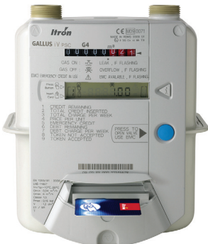
Gallus IV PSC with smart card

Two-way multi-resource prepayment system: Eclipse Enterprise Edition (3E)